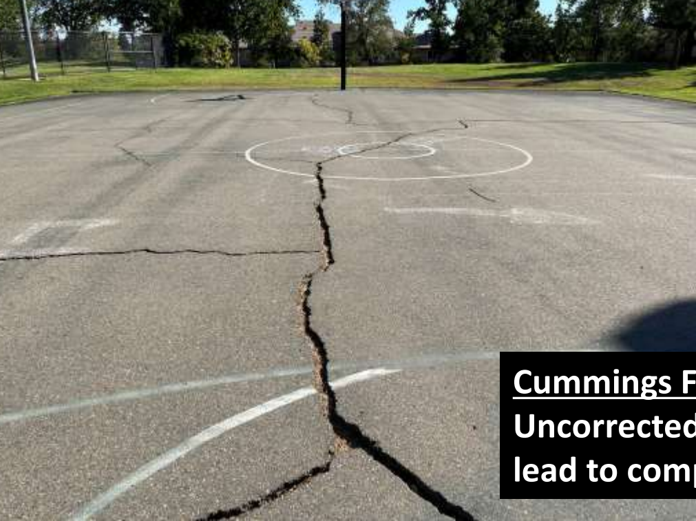
Cummings Family Park: Uncorrected court cracks have lead to complete court failure