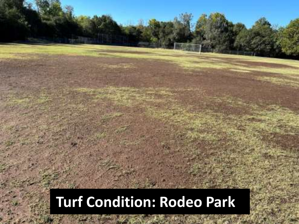
Turf Condition: Rodeo Park