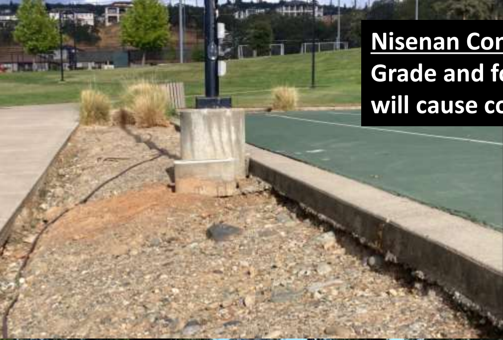
Nisenan Community Park: Grade and foundation erosion will cause court failure