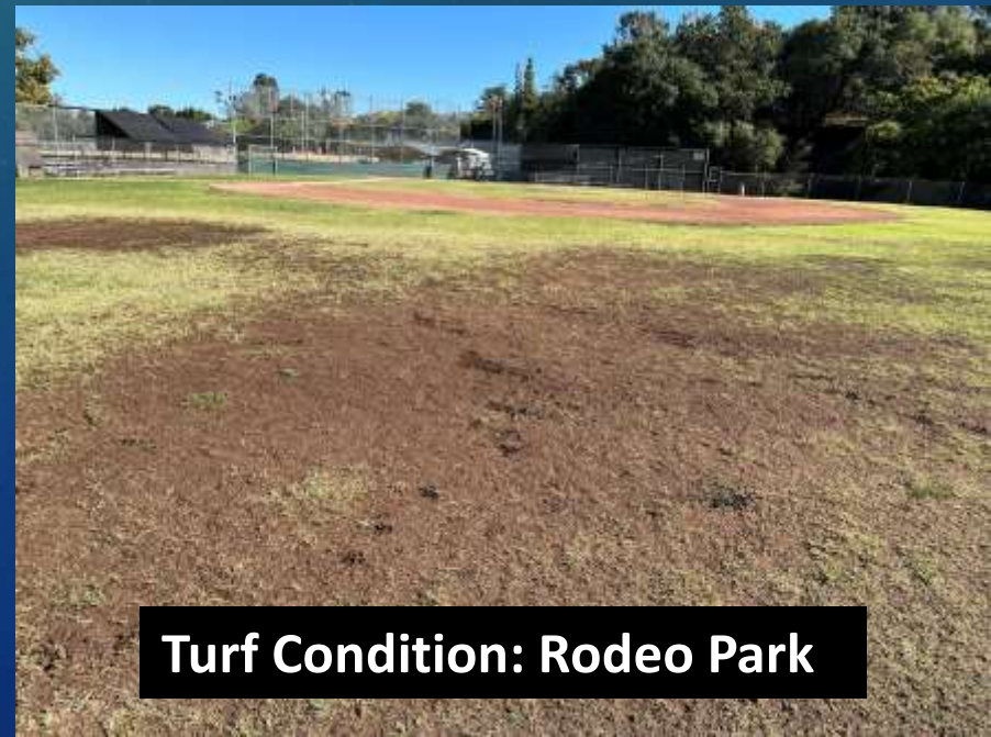
Turf Condition: Rodeo Park