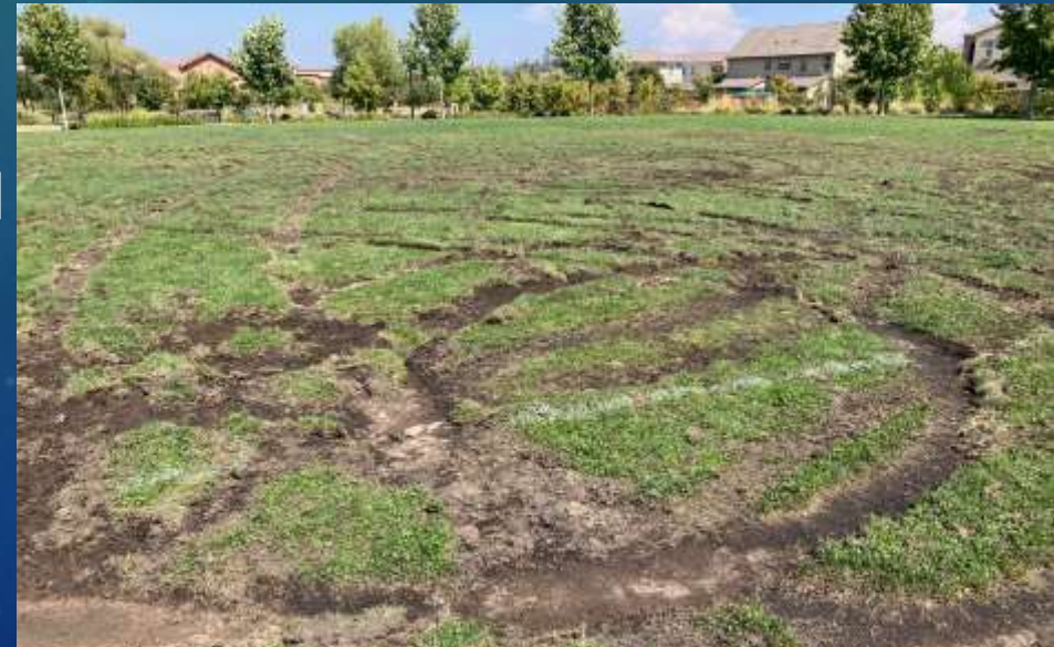
Vandalism: Econome Park – field ruined