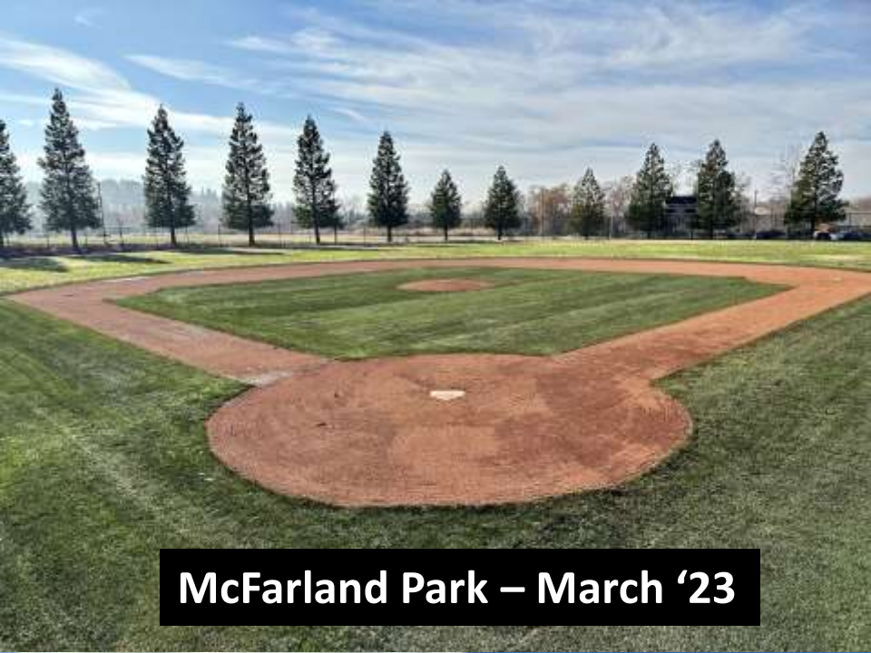
McFarland Park – March '23