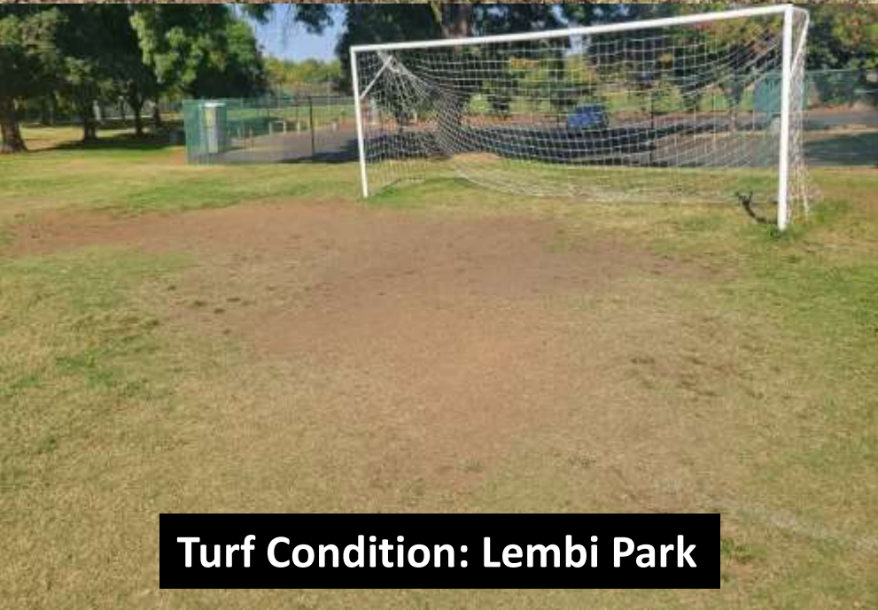
Turf Condition: Lembi Park