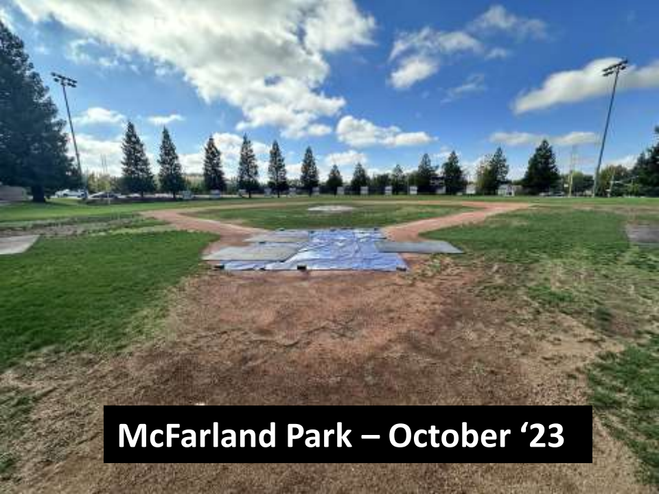
McFarland Park – October '23